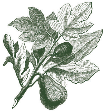
FIG · GARDEN HOME · OWNERS ASSOCIATION