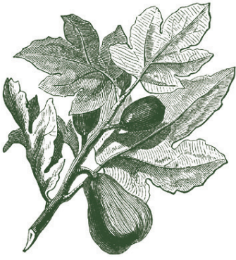
FIG · GARDEN HOME · OWNERS

We have revamped our website www.OldFig.org . Please visit the site and let me know what you think. If you have any comments for improvements, please provide them in our comment box. A new website has been a long time in coming and I think we made some great improvements.